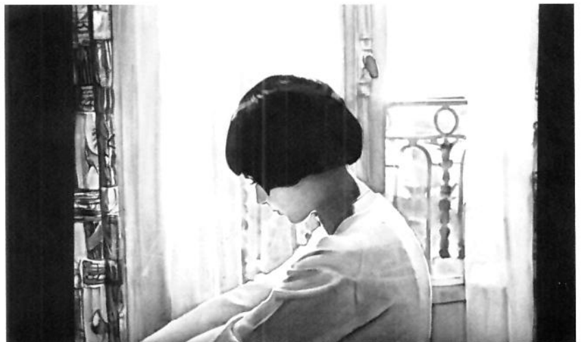
Exhale, 2012, Charcoal on paper, 36 x 60 in. (91 x 152 cm)