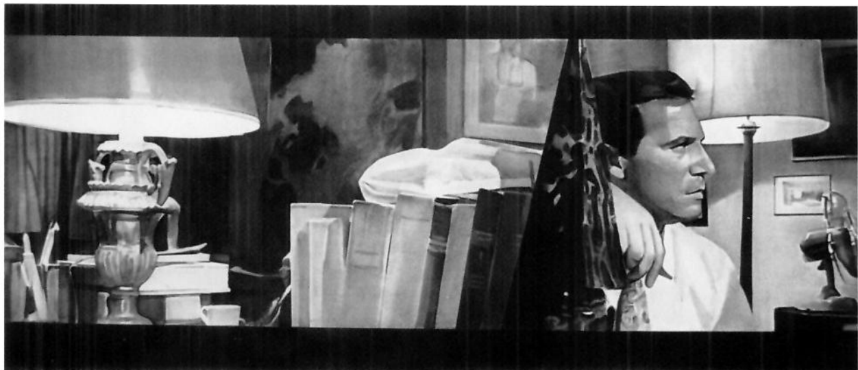
Man in Room , 2012, Charcoal on paper, 48 x 108 in. (122 x 274 cm)